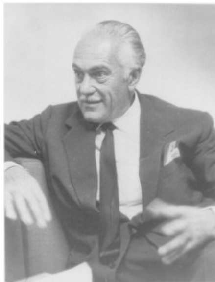
Aurelio Peccei 1908 – 1984

In late 1981, I bought and read a book entitled 'One Hundred Pages for the Future' by Aurelio Peccei. Aurelio was a very senior Italian industrialist and a high-level executive with the Fiat Motor Company. Having been a co-founder, he was the President of the Club of Rome, a global and very high-level (Deep State controlled) 'think-tank' that was tasked to find sustainable ways to protect the Earth's ecosystems from ruthless exploitation. This book was Aurelio's personal assessment of what humanity was doing to the planet Earth. As an aspiring but easily influenced political green, I was really impressed and showed my uncle the book. He told me to write to Aurelio and to ask him for a meeting, which I duly did. A few weeks later, I received a hand-written letter from Aurelio saying that he would be in London in June 1982 attending an international conference on the environment and would be delighted if I would go and have lunch with him.