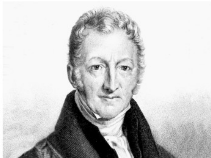
Thomas Malthus FRS 1766 – 1834

Sounds too fantastic to be true? I'm afraid not – this plan for global tyranny has already been laid out in the United Nations' Agenda 21 which, in turn, has now been upgraded and updated into UN Agenda 2030 for 'transforming the world' by fully embracing 'sustainable development'.