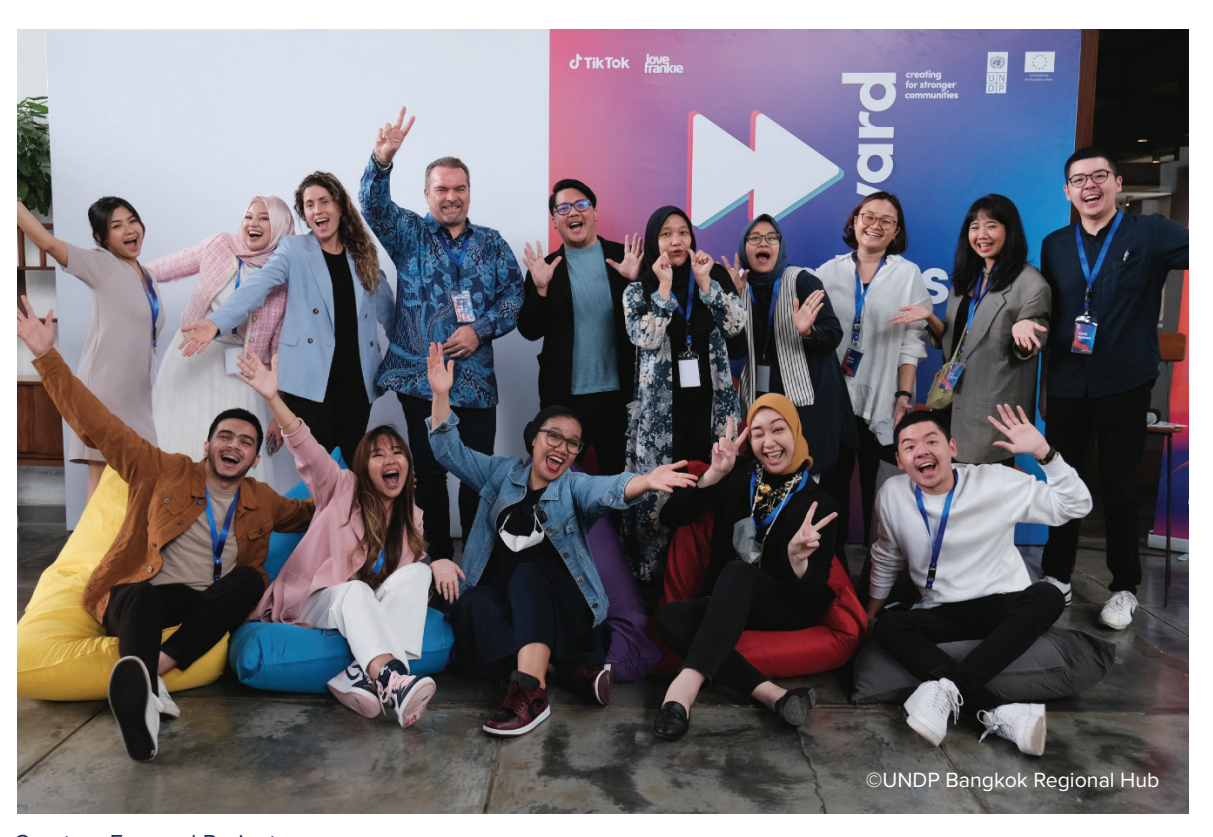
Creators Forward Project